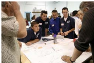
Design Team at Work

Each team was comprised of architects, associates, faculty and students. Registered architects served as coaches, and associate and student AIA members joined with ACE Academy students to develop unique designs that incorporated both aesthetics and function. With a lot to accomplish in 90 minutes, there was no time for a seventh-inning stretch.